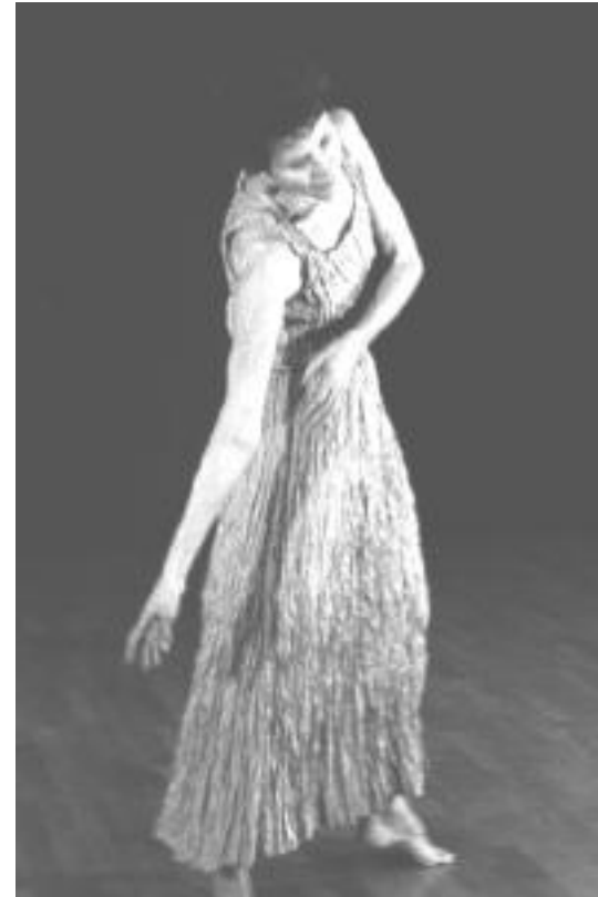
© Notation by K. Hermes-Sunke and S. Bodak